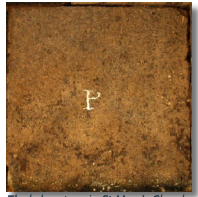
The ledgerstone in St Mary's Church, beneath which Pope's body lies

This description suggests that the coffin, though of unusual shape, had not been moved or opened before; its ashes